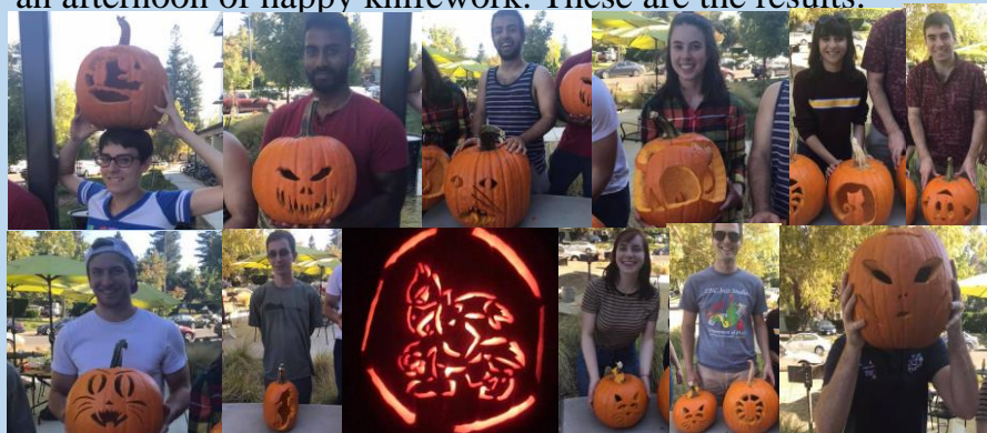
Lots of friends with pumpkins! Mine's the illuminated Falco in the middle

In keeping with my strong belief in the binding strength of pumpkin carving, I organized a trek to the punkin patch and an afternoon of happy knifework. These are the results.